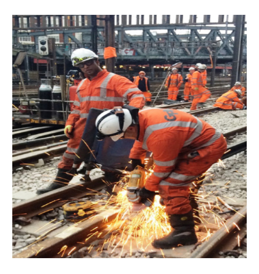
Example of hot working

Before hot work is carried out you must have a hot works permit and a fire watchperson must be present.