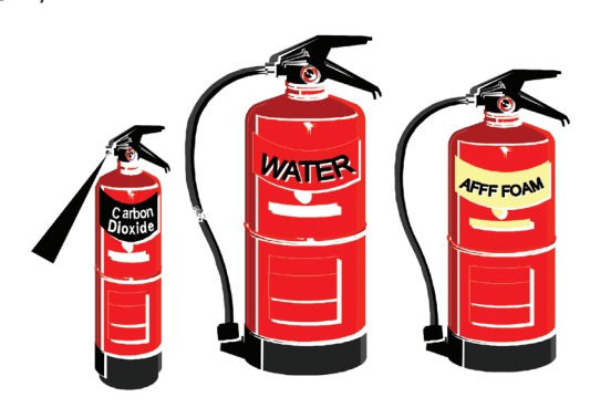
Types of fire extinguisher