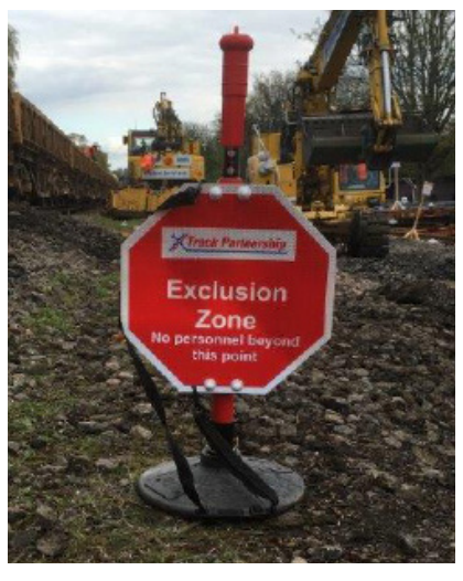
Example of an exclusion zone

The exclusion zone(s) will be included in the worksite briefing carried out by the site person in charge.