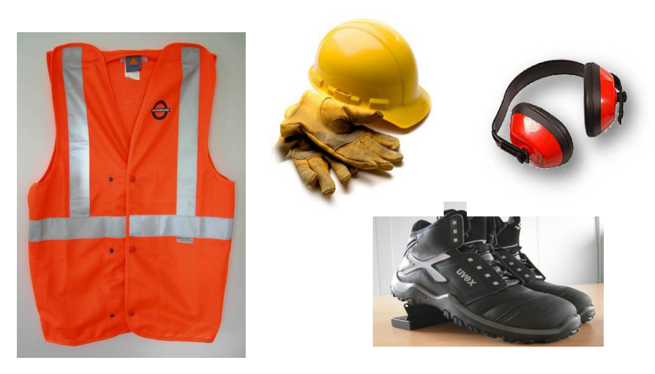
Examples of PPE

PPE must be in good condition and worn as stated in the method statement.