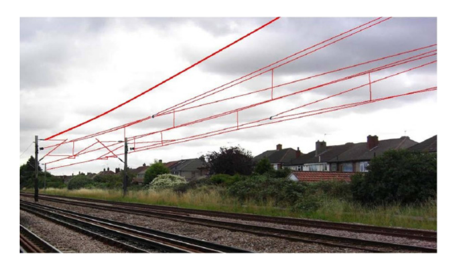
Example of Overhead Line Equipment

Work must not be carried out above any OLE equipment, for example, on bridges and embankments, unless there is a physical barrier protecting the work area from the OLE, or the correct isolation and earthing arrangements have been made by Network Rail.